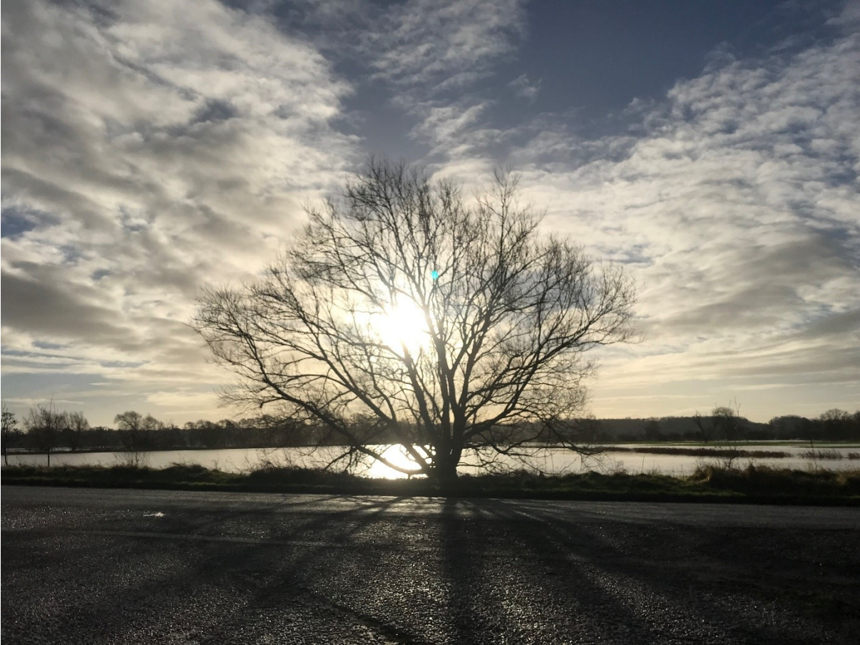
A welcome apple stop on the Broome Walk