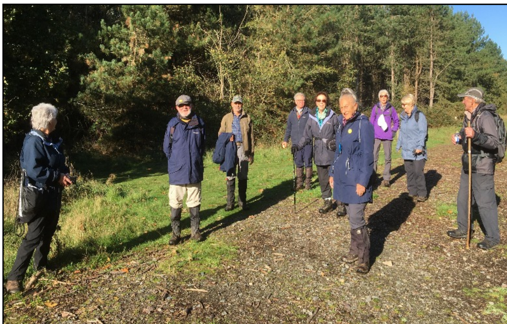
Last walk before lockdown