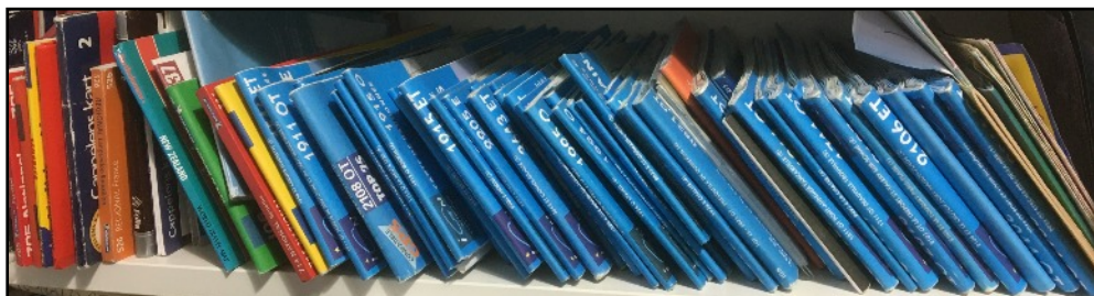
(Road)Maps to freedom