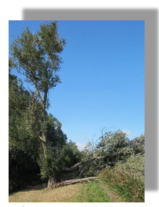
Gales bring down branches onto river path at Worlingham