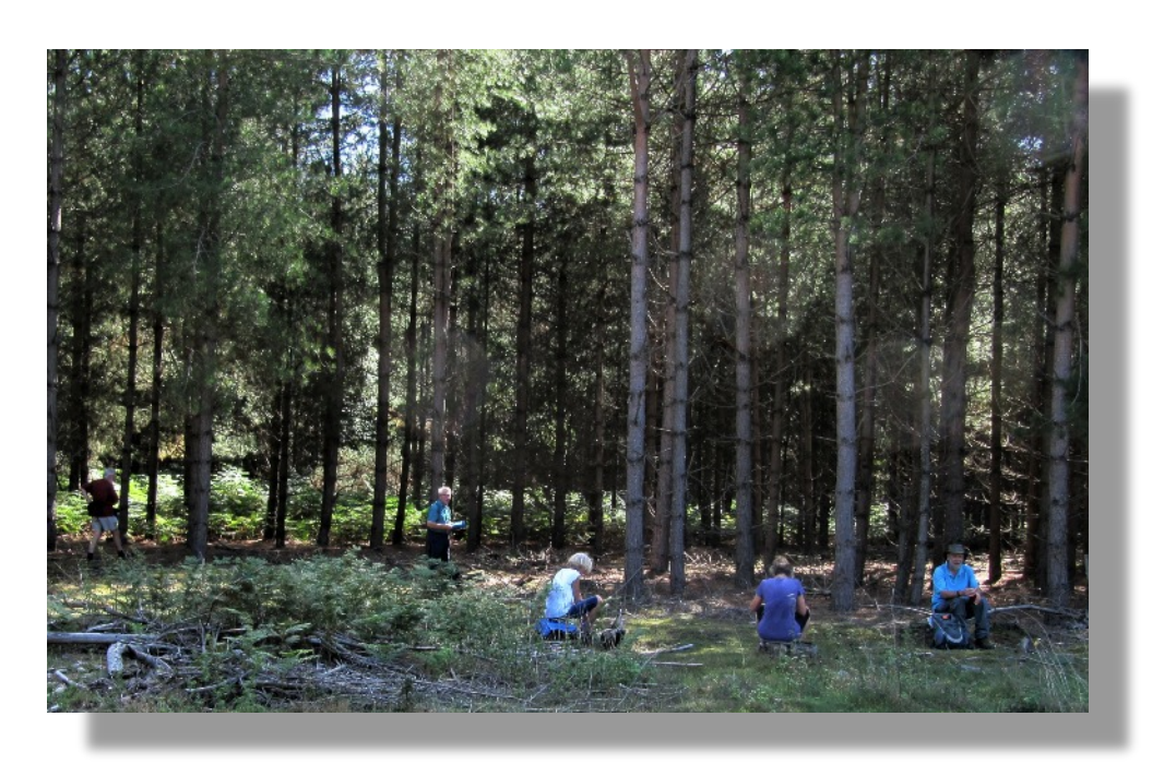
Socially-distanced lunch stop on Sandlings Way