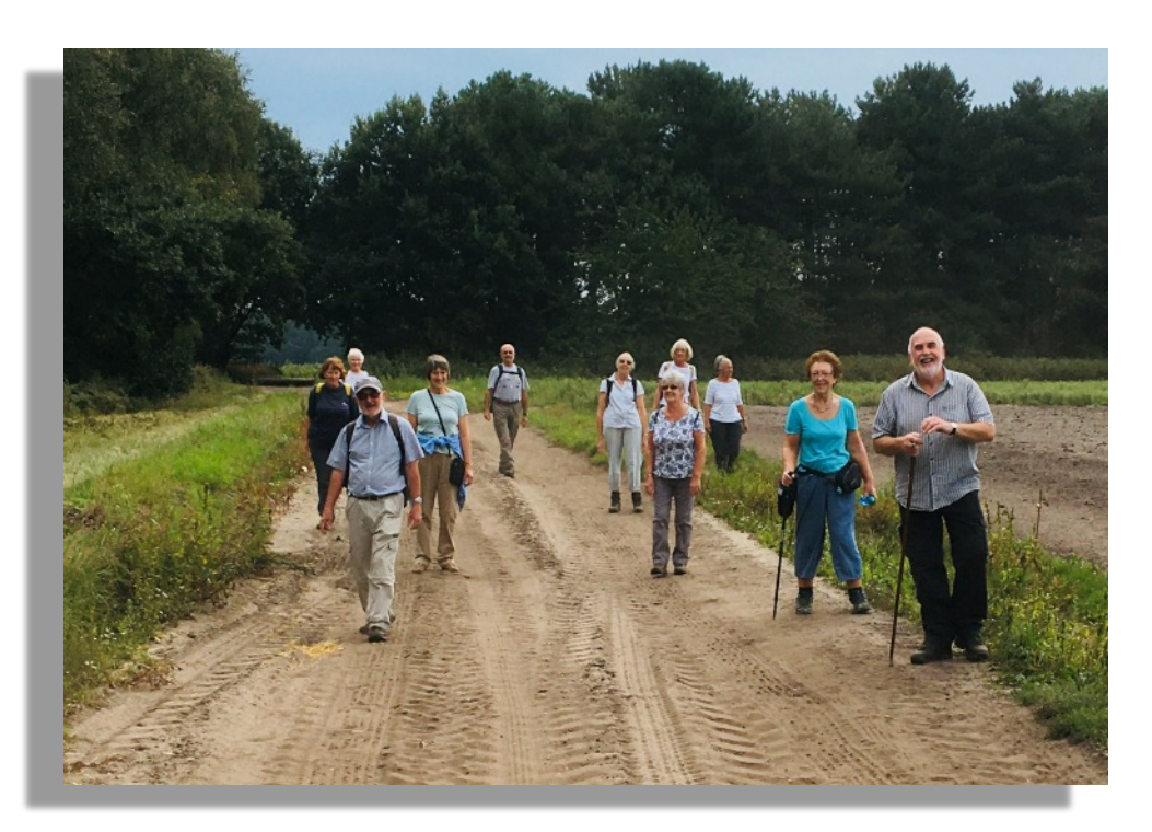
Iken Walk in September