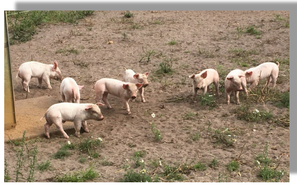
Piglets on Iken walk checking our social distancing