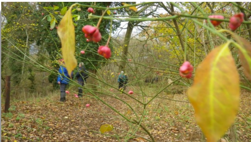
Newbourne and Waldringfield Walk