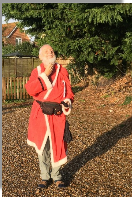
... is this the real Santa ?