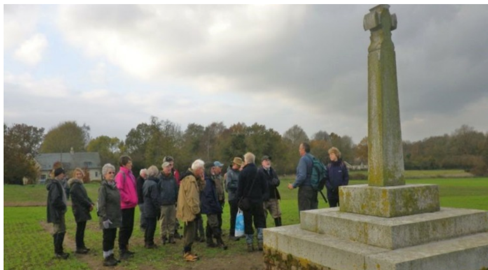
Information stop on Historic Hoxne walk