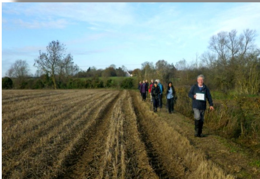
Eye and Thorndon walk