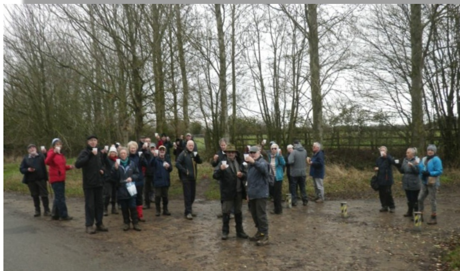
Mince Pies and Mulled Wine Stop