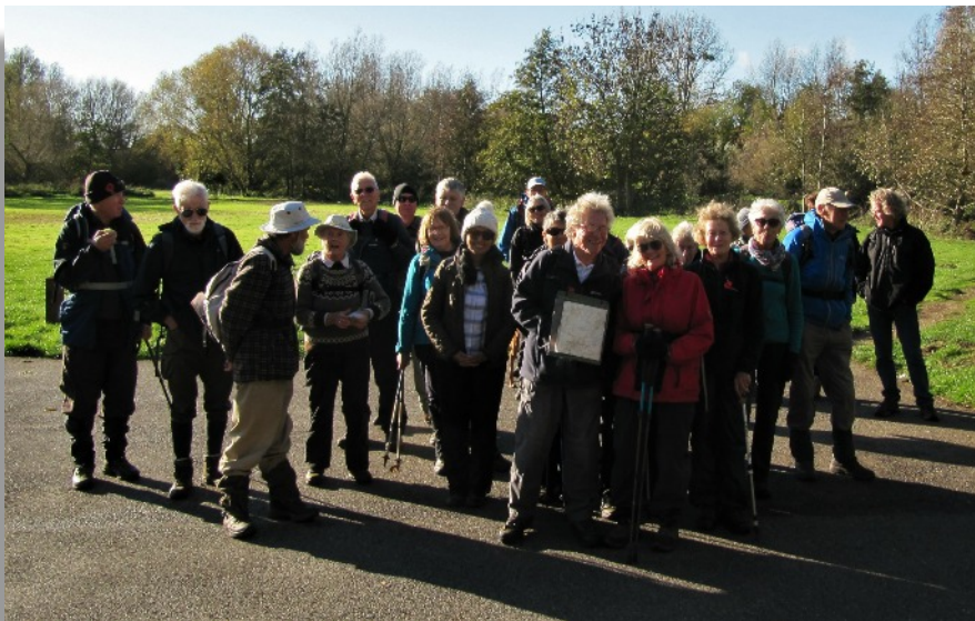
Nice turnout at Billingsford