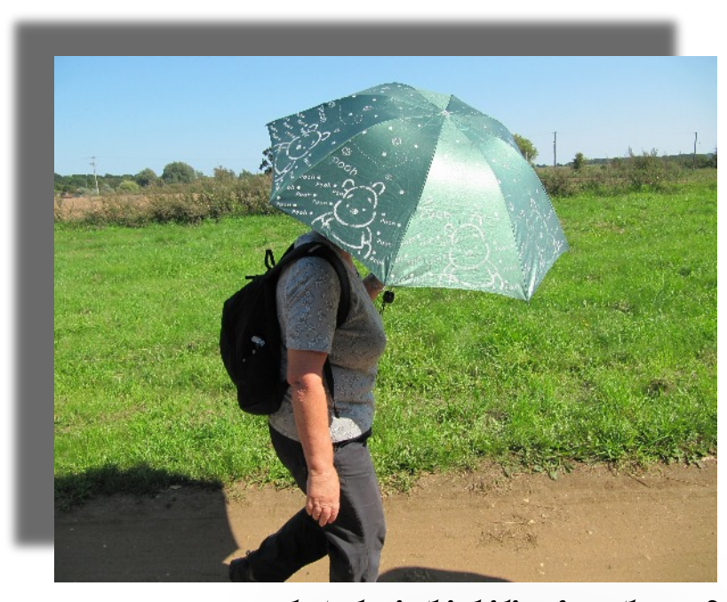
... but who is this hiding from the sun?