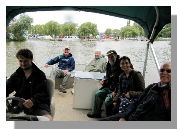
Ferry walk at Burgh St Peter