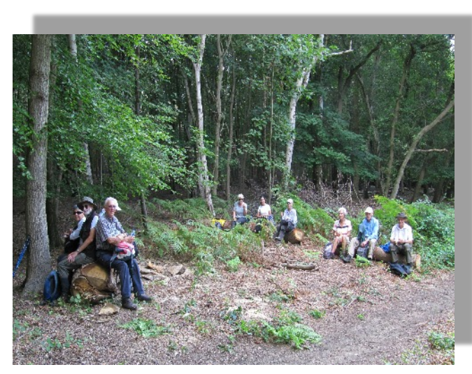
Lunch on Iken walk