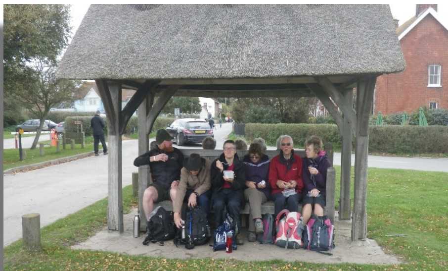
Lunch-time at Walberswick