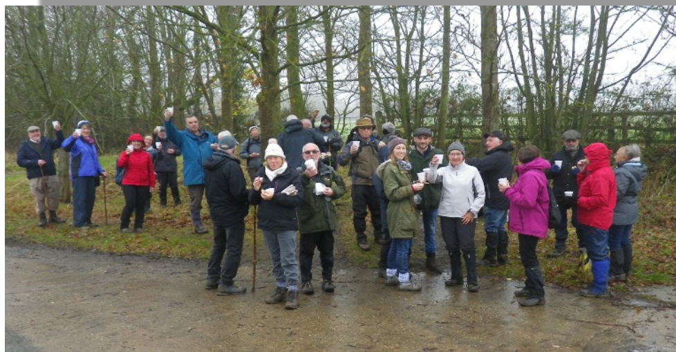
Mince pies plus on Woodton pre-Christmas walk