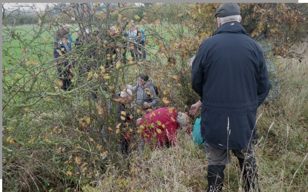
The ditch on Fritton & Boudicca Way walk