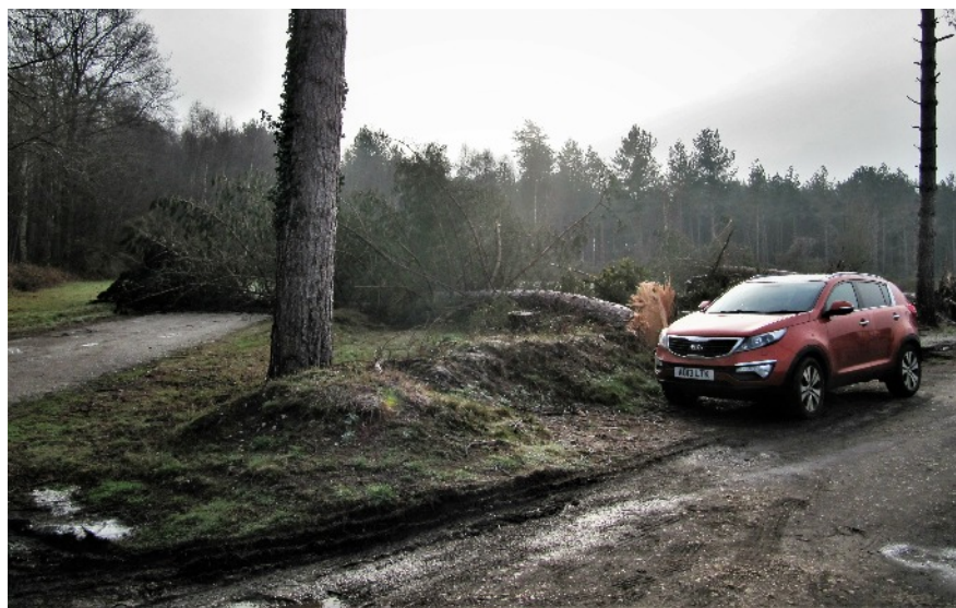
January gales block Dunwich forest car park