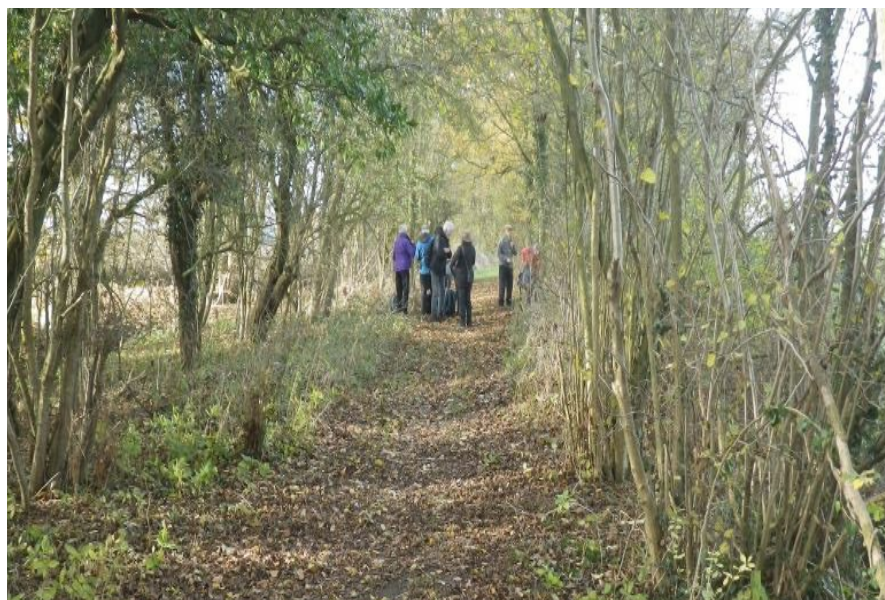
Wissett & St James