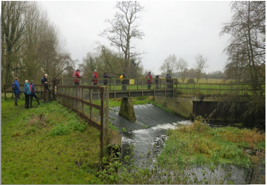
Billingford Area walk