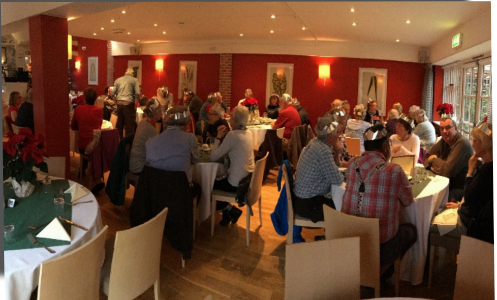
Christmas Lunch Walk